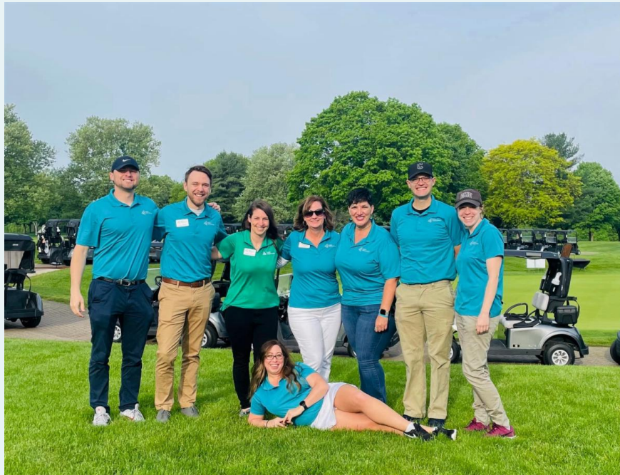
New color reveal by staff at the JA Golf Classic at Shady Hollow Country Club

Notice anything different lately? That's right – JA has gone teal ! Though our look is different, our mission remains focused: we envision a world where young people have the skillset and mindset to build thriving communities. We have been committed to students for over 100 years and we are looking forward many more years of impacting our next generation.